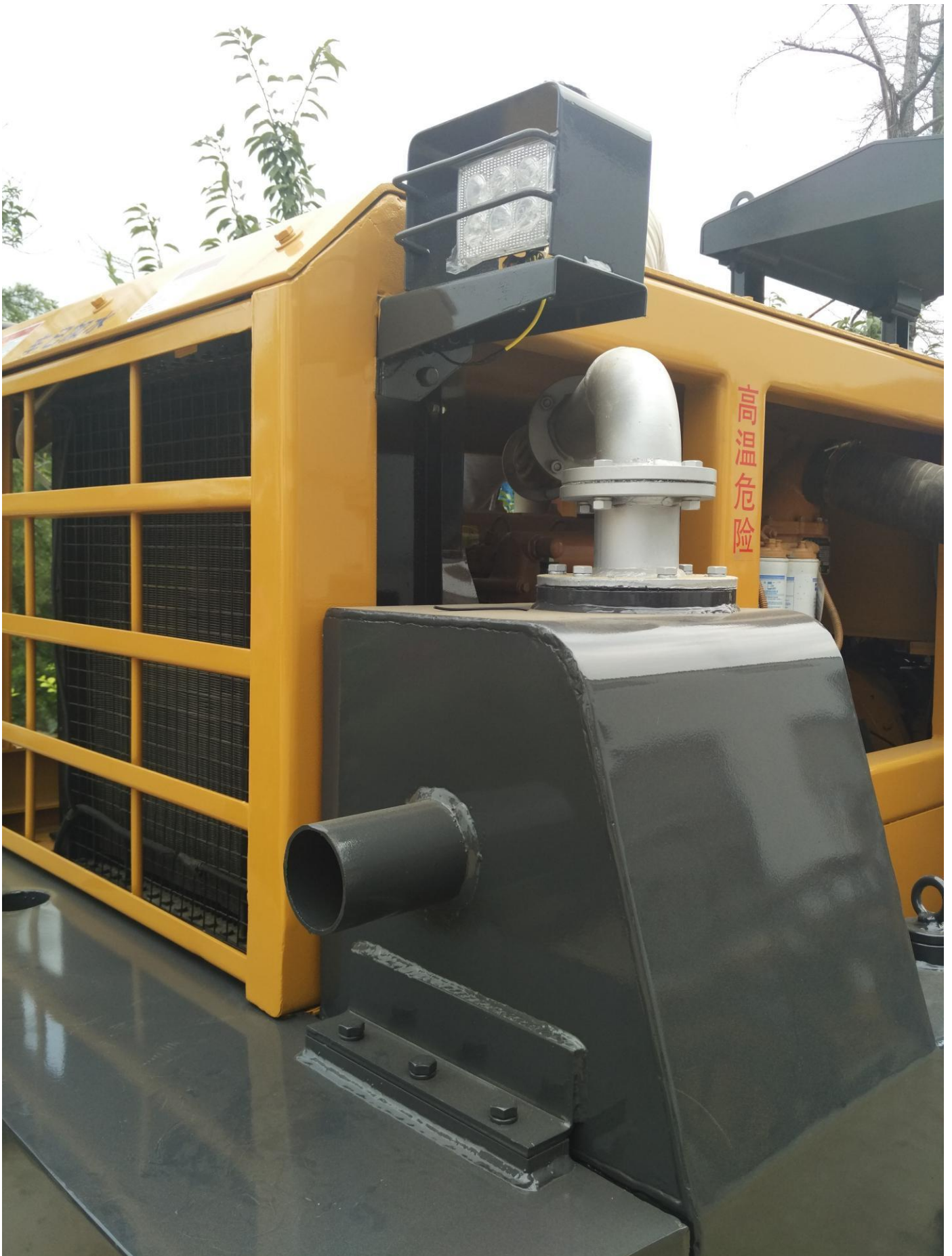
.40mm high-quality steel plate boom

QINGDAO EAGLELION ENGINEERING MACHINERY CO.,LTD