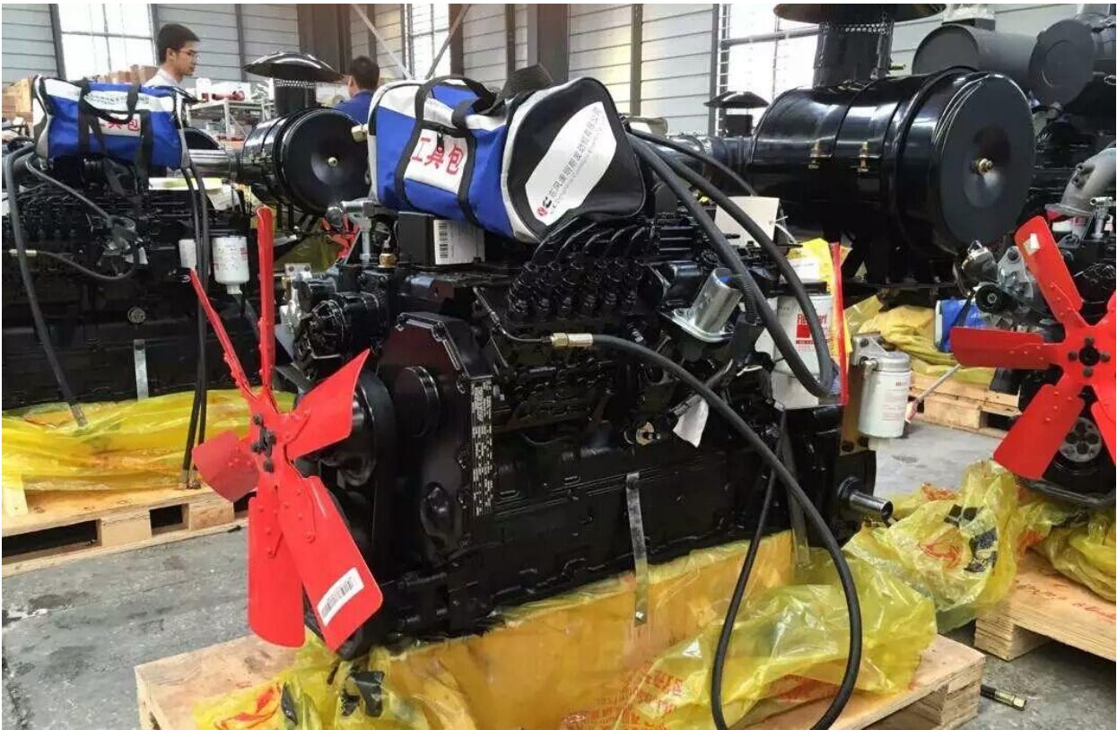
Deutz WP6G engine