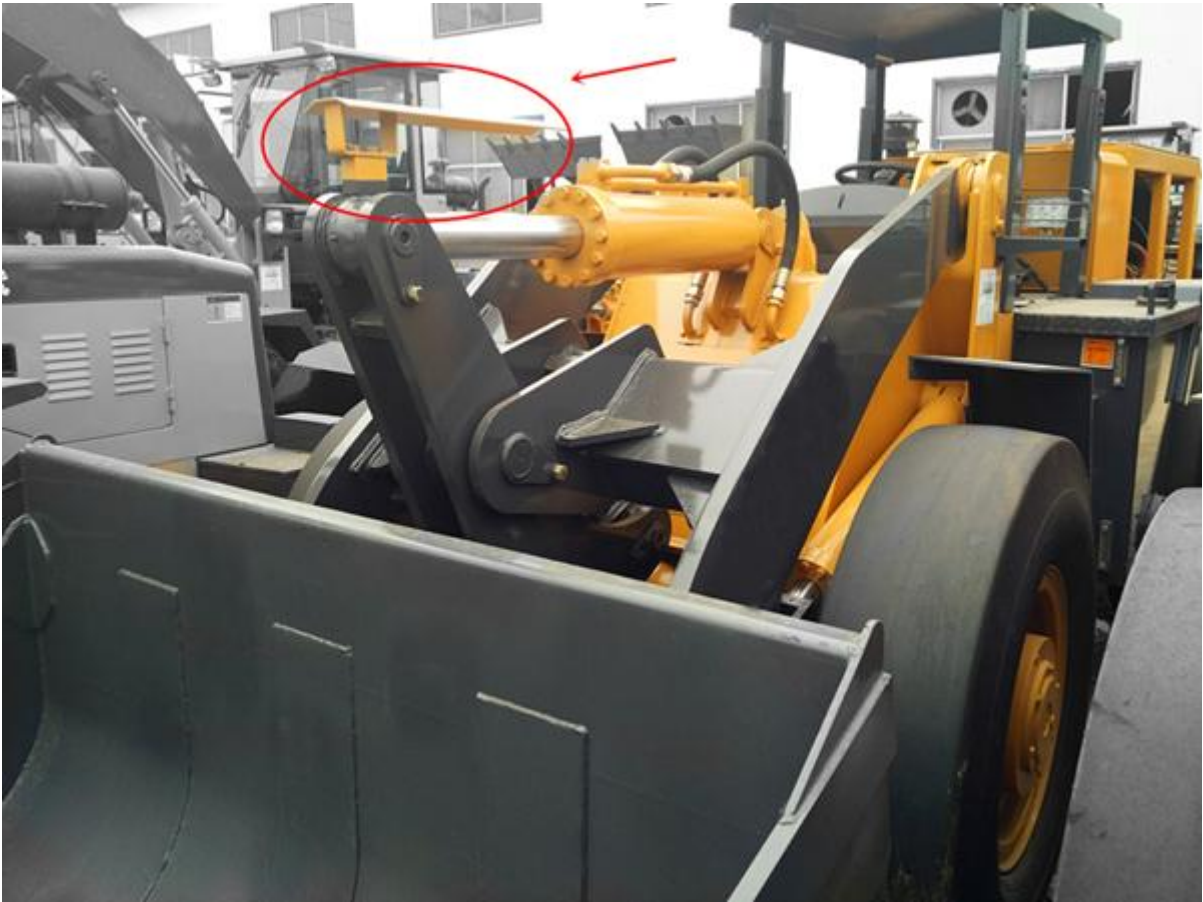
Oil bath type air filter