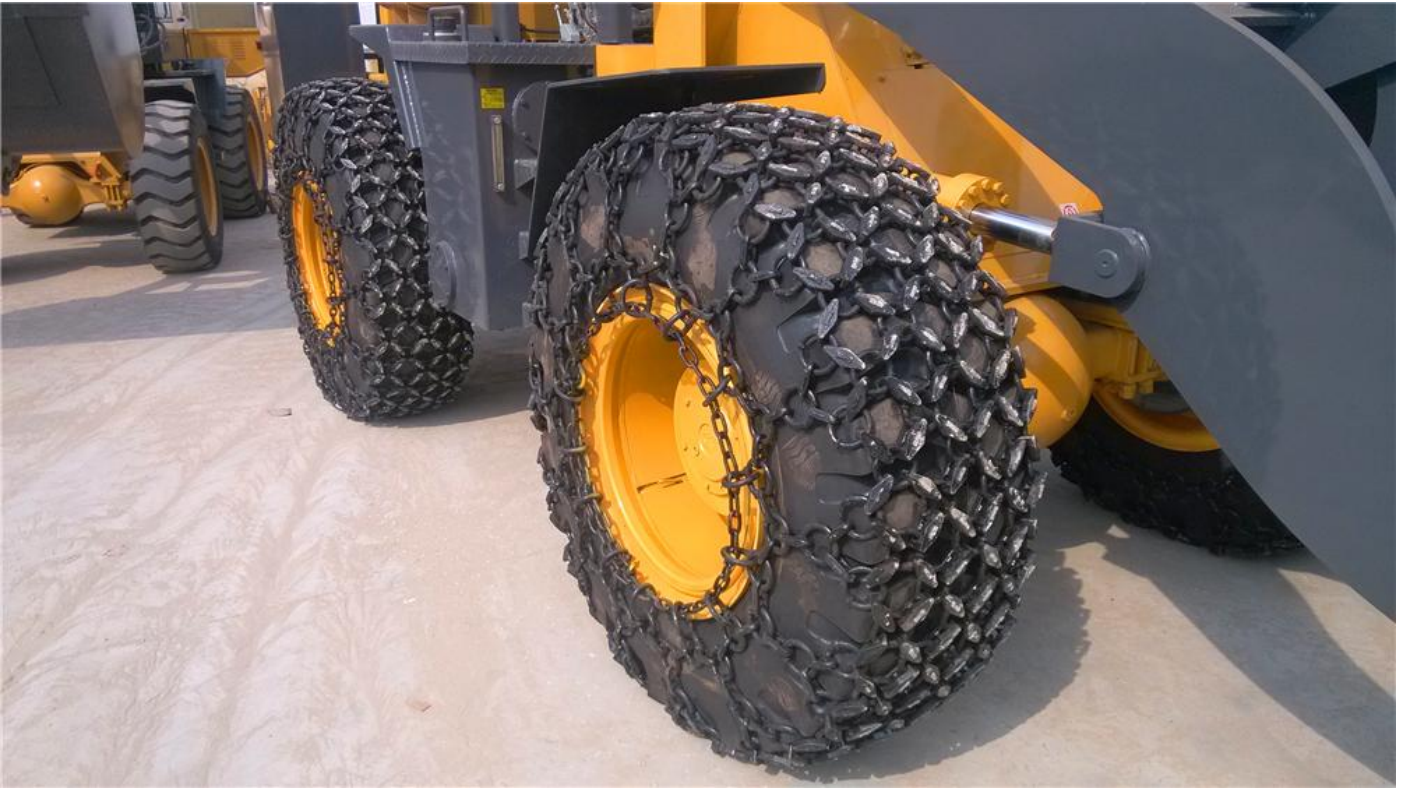
Smooth anti puncture narrow tire.