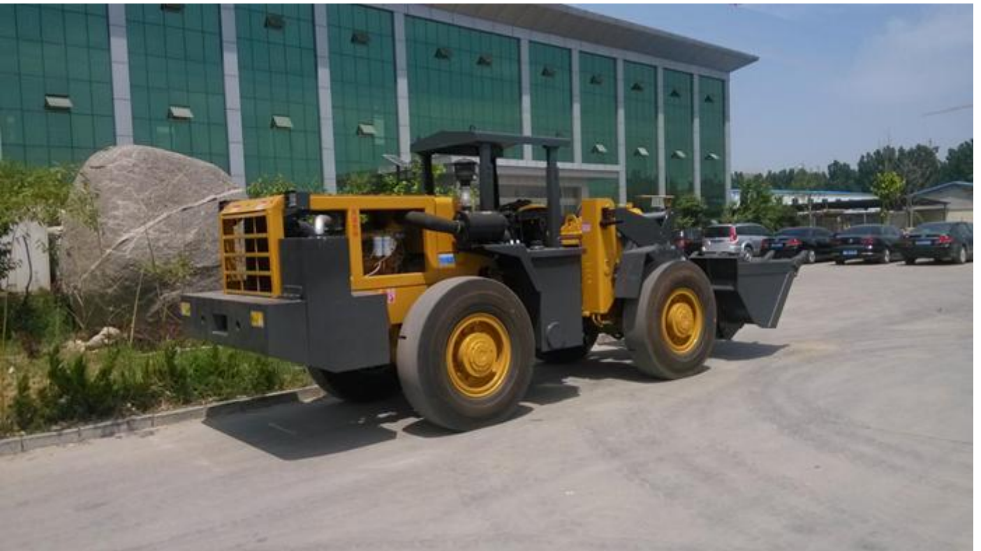
Side dump bucket