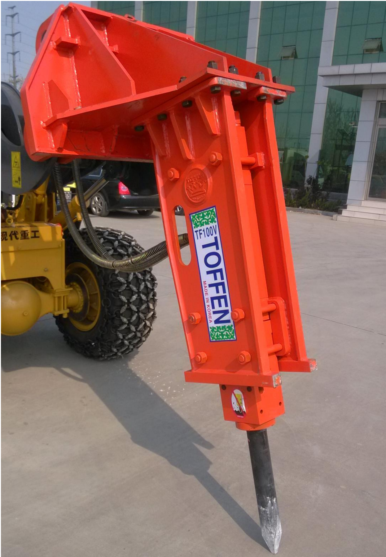
Wet brake axle .

QINGDAO EAGLELION ENGINEERING MACHINERY CO.,LTD