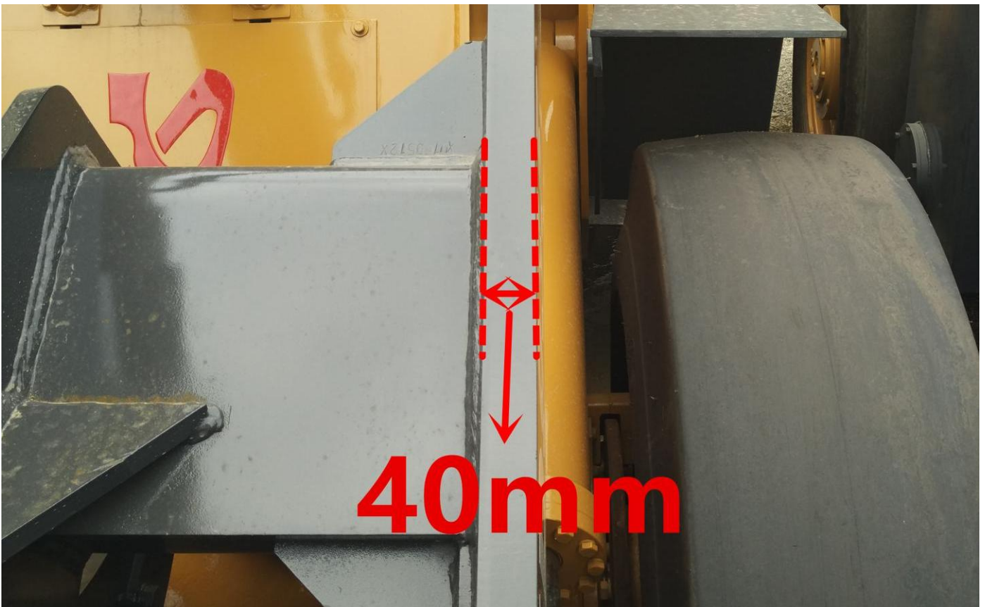
Leveling rod with the protection function of the cylinder.